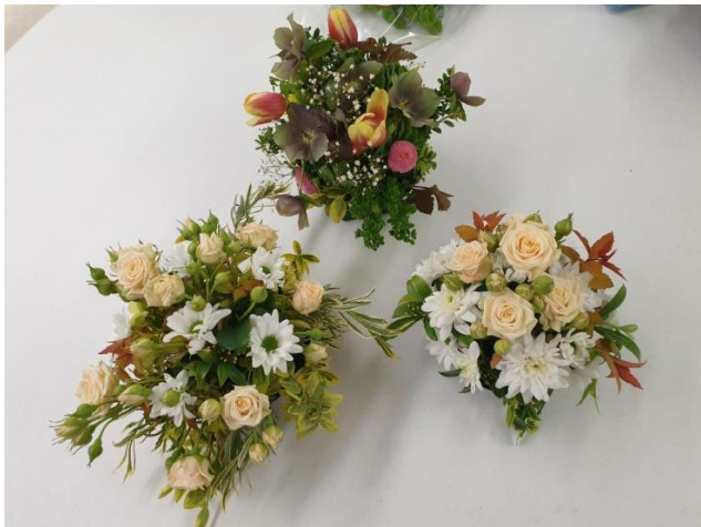
More beautiful arrangements