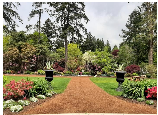
The Glades entrance