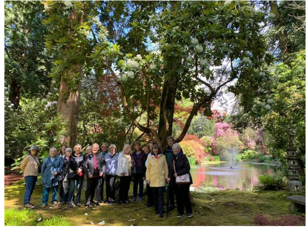
A happy group

woodland garden. They also advised they have fall tours to see beautiful colours of Maples and burning bushes, etc.. The City of Surrey is expanding the Glades to an ultimate size of 15 acres.