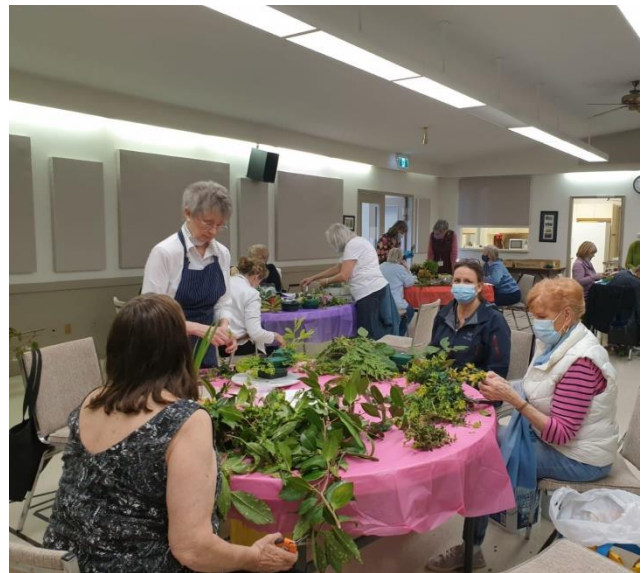
Everyone hard at work

About 20 people enjoyed the workshop in May. It was a happy place, with lots of visiting and sharing, and many really lovely designs.