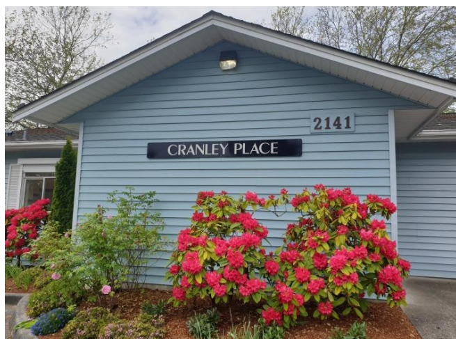
New photo submitted by Margrit Elmiger-Isert