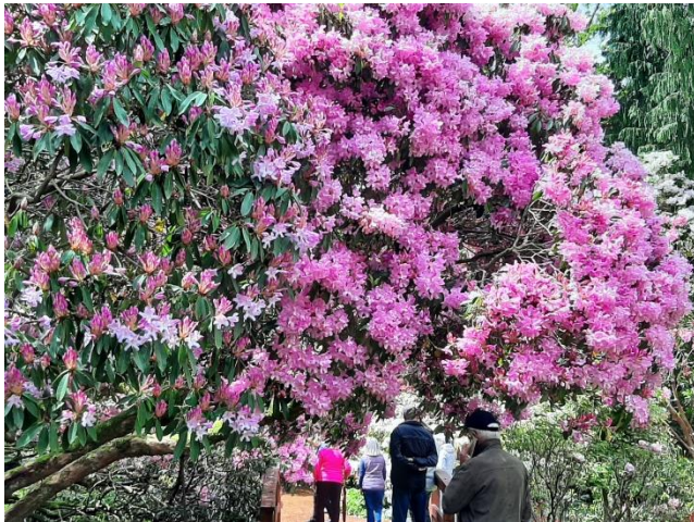
The enormous size of some of the rhododendrons