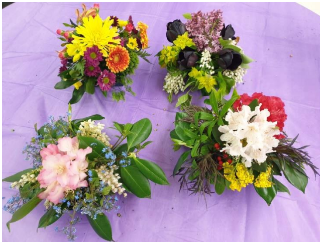
Beautiful arrangements from one table