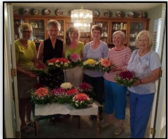
Six Floral Circle gals at work